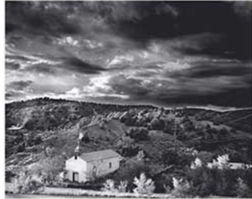
WINDY AND DRYING STORM, CALHOUNITE AT BRADY EXCAVATION, NEW MEXICO