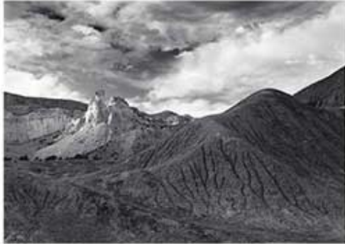
CHERRY BONE AND THE RED HILLS OF SMITH RANCH, NEW MEXICO