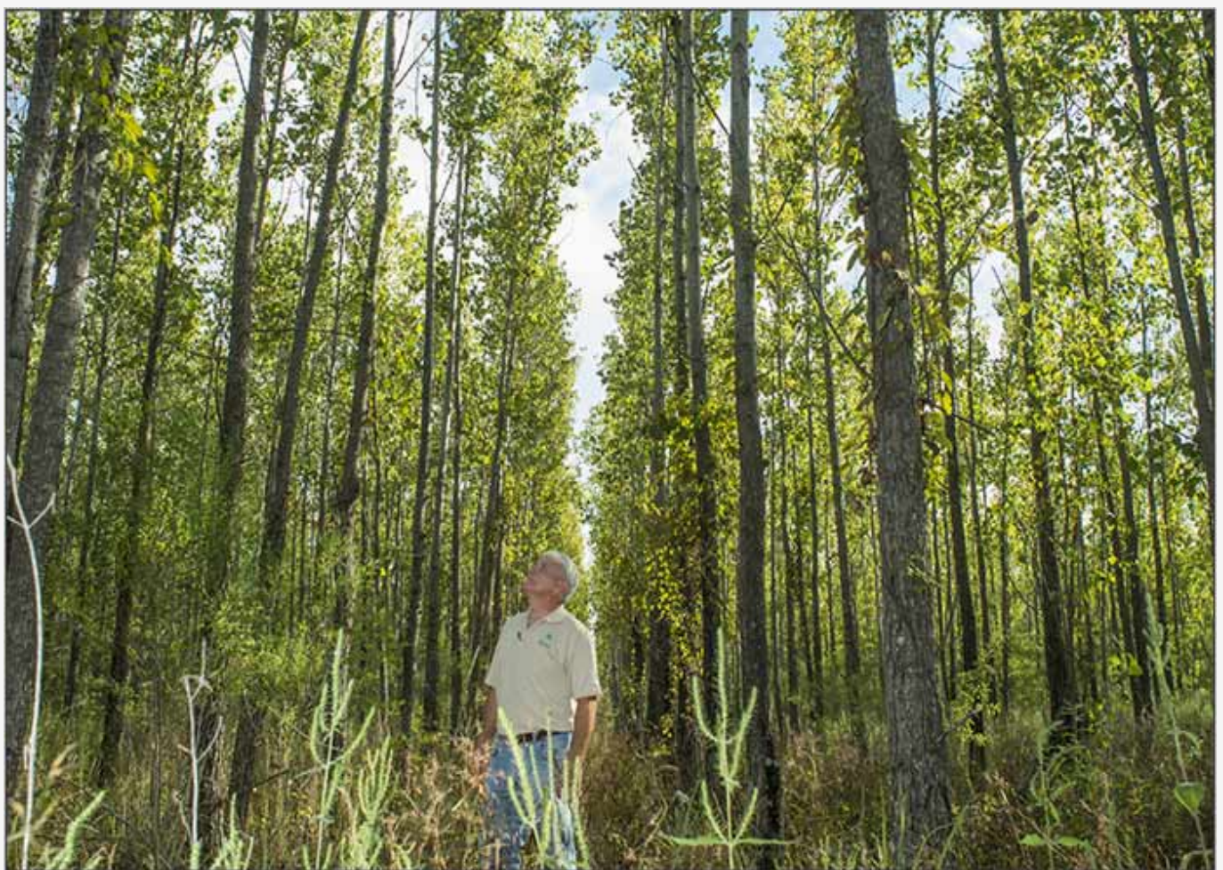
GREENTREES CARBON SEQUESTRATION FOREST

MADISON, Wis., Oct. 5, 2020 (SEND2PRESS NEWSWIRE) – Artisan Dental, based in Madison, Wisconsin has partnered with Carbon Credit Capital and GreenTrees to certify Artisan Dental as the first carbon neutral general dental practice in the United States. Artisan Dental now offsets 100% of its greenhouse gas emissions associated with the company's operation including team business travel, team member commutes, office energy, and procurement of all supplies and materials required to provide oral health care services.